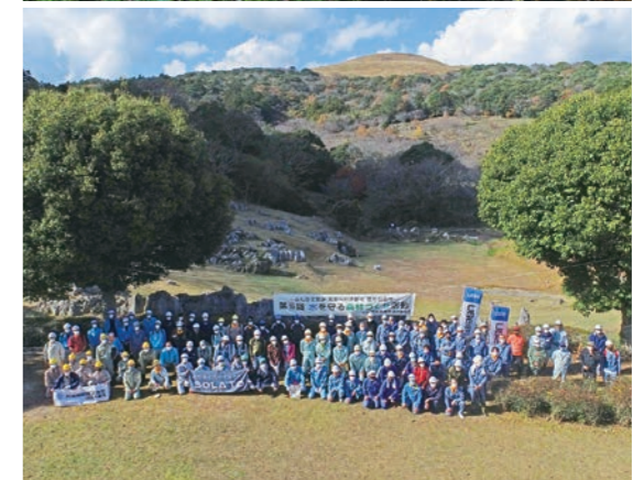
Employees participating in the 15th Forest Creation Experiential Activity for Water Conservation